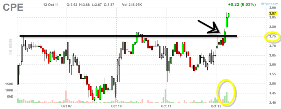
CPE [NYSE] Callon Petroleum Co. Basic Materials | Independent Oil & Gas | USA