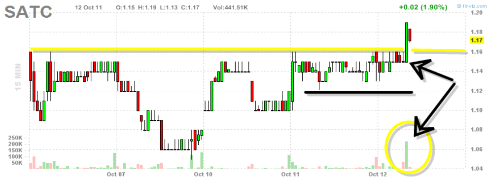
SATC [NASDAQ] Satcon Technology Corporation Technology | Semiconductor - Integrated Circuits | USA