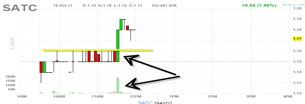
SATC [NASDAQ] Satcon Technology Corporation Technology | Semiconductor - Integrated Circuits | USA