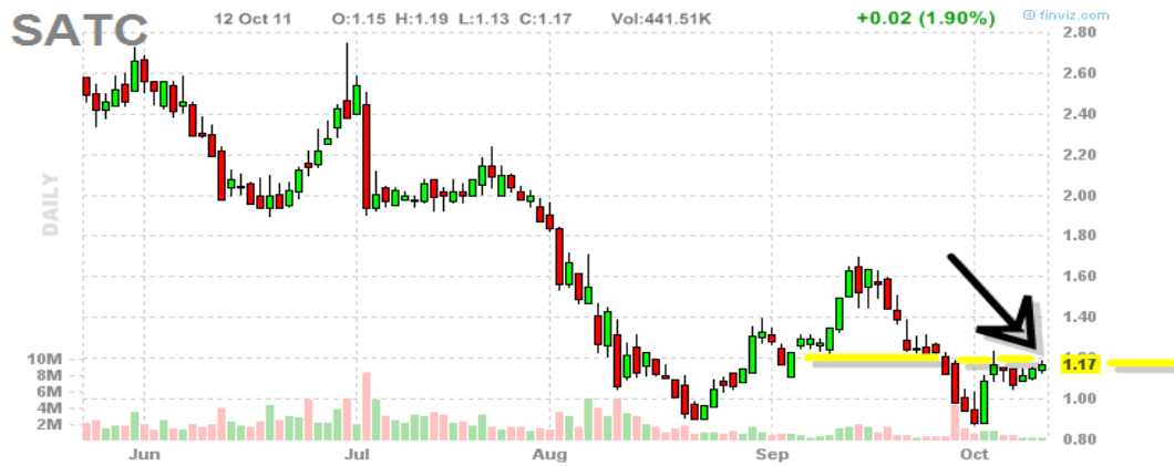
SATC [NASDAQ] Satcon Technology Corporation Technology | Semiconductor - Integrated Circuits | USA