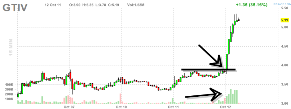
GTIV [NASDAQ] Gentiva Health Services Inc. Healthcare | Home Health Care | USA